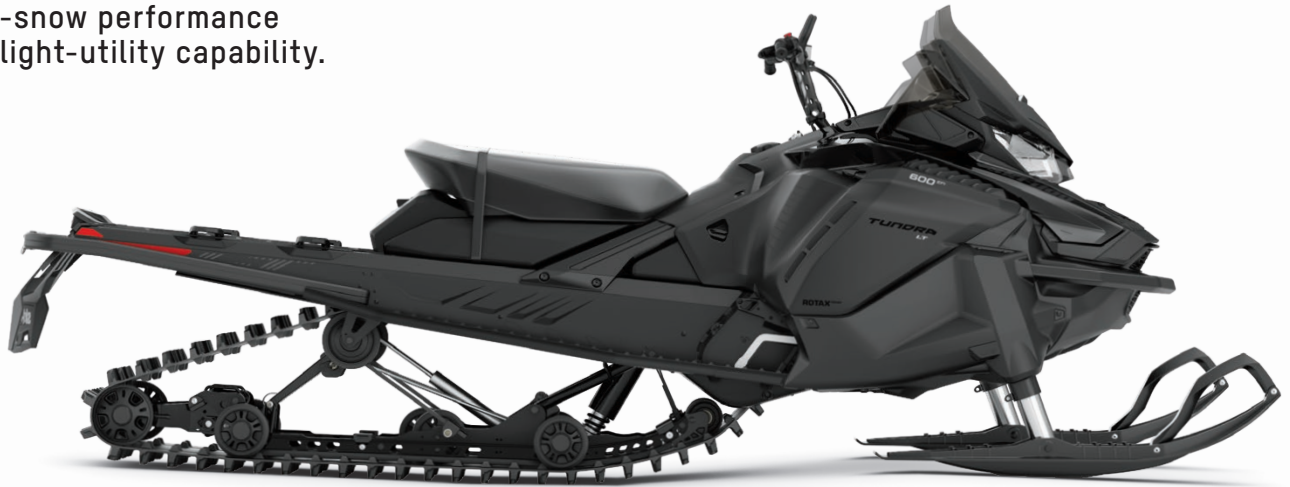
TUNDRA LT 600 ACE SHOWN

Great off-trail and deep-snow performance with light-utility capability.